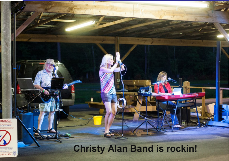
Christy Alan Band is rockin!