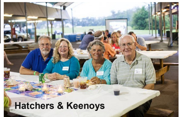
Hatchers & Keenoy's