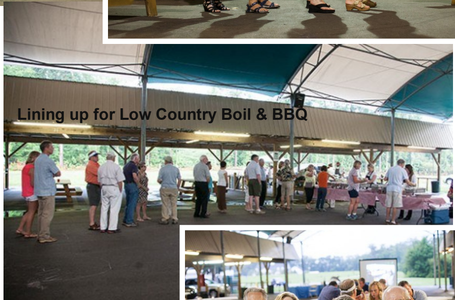
Lining up for Low Country Boil & BBQ