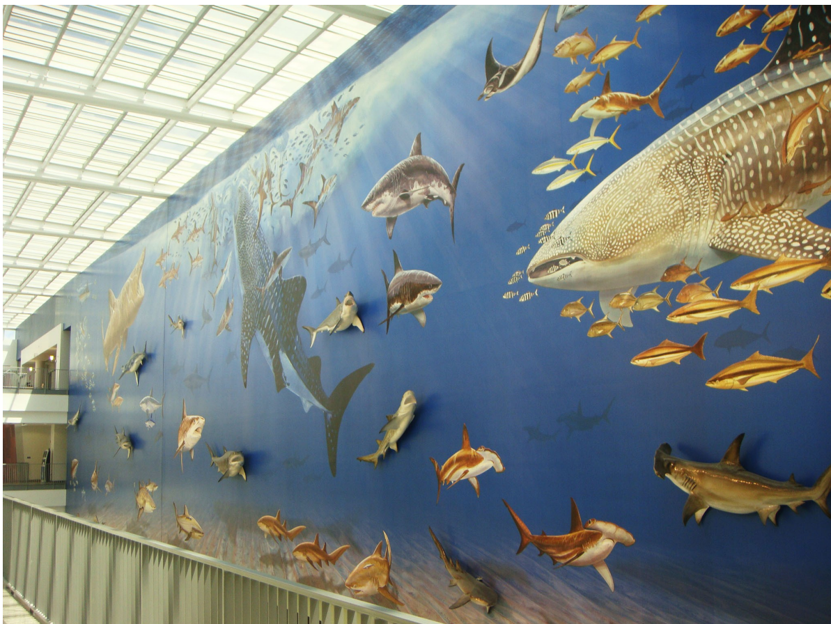
Awesome 3-D mural by Guy Harvey in the Student Center at NOVA Southeastern University. The school mascot is the shark.

Estuary Charleston stock of bottlenose focus of study for crabbing association. How are these intelligent animals entangling themselves in a single line from pot to buoy? At least one death per year associated with Charleston